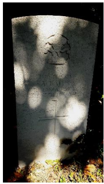
No 1 Arthur Bates