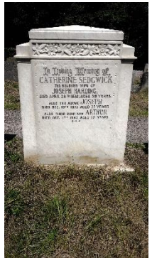
No 7 Arthur Harding