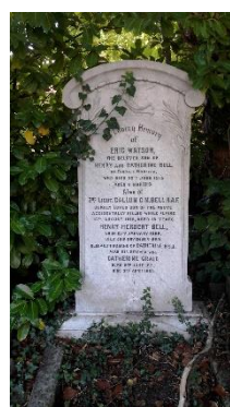
No 6 Callum Bell