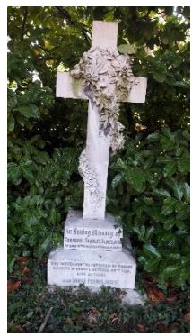
No 5 Stanley Jones