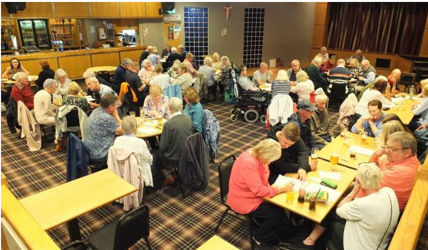
PUB QUIZ NIGHT