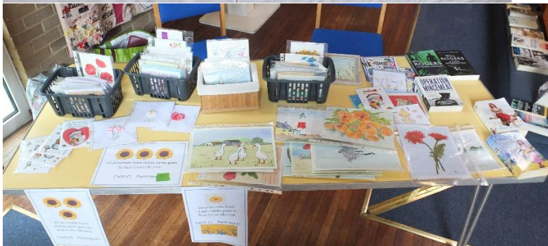
CARD MAKING WORKSHOP