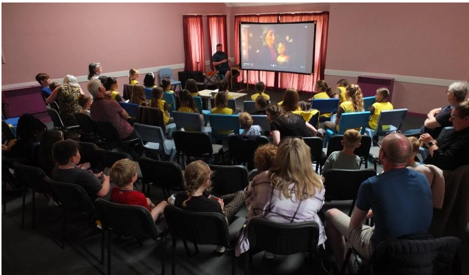
FILM NIGHT ENCANTO