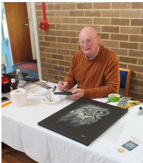
SOME PHOTOS TAKEN FROM THE ART AND CRAFT EXHIBITION